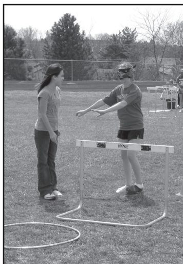
"Trust me." Students lead each other through the obstacle course - blindfolded!