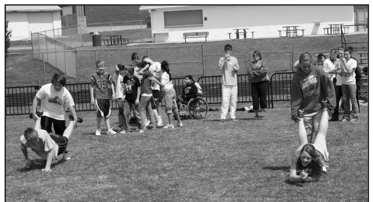
Wahoo Middle School students participate in the wheelbarrow race on April 16.