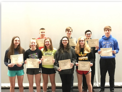
8th Grade Students