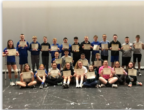
7th Grade Students