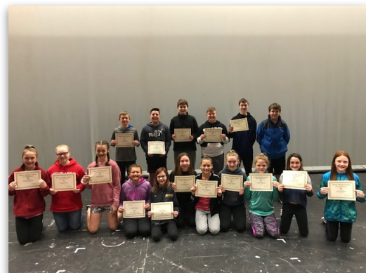
6th Grade Students