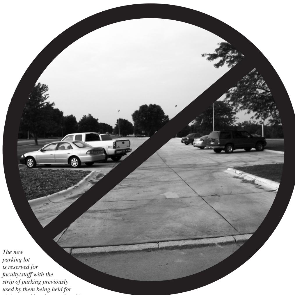
The new parking lot is reserved for faculty/staff with the strip of parking previously used by them being held for visitors and handicapped parking.