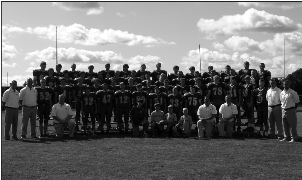
2009 Football Team

G old and Blue. Two united colors facing off on a 100-yard battle field in a civil war of sorts on Aug. 21. The Warrior football team performed well during their scrimmage showing eager fans what is to come this season.