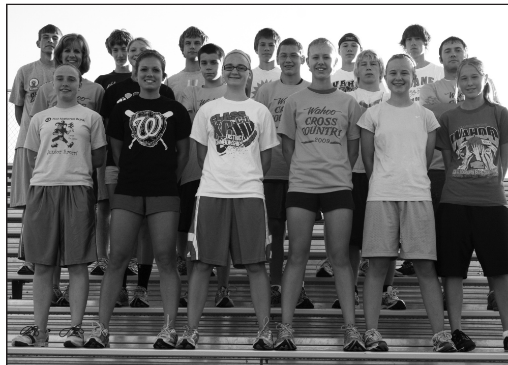
2009 Cross Country Team