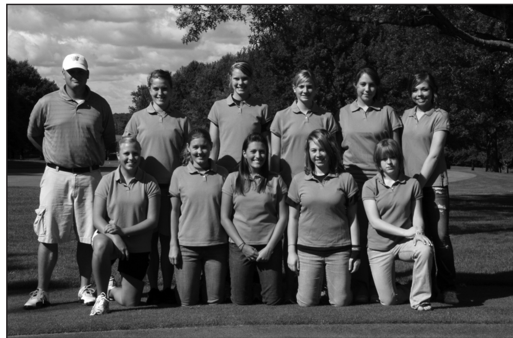
2009 Girls Golf Team

So far the girls are looking like machines on the green and we can't wait to see more success from the team.