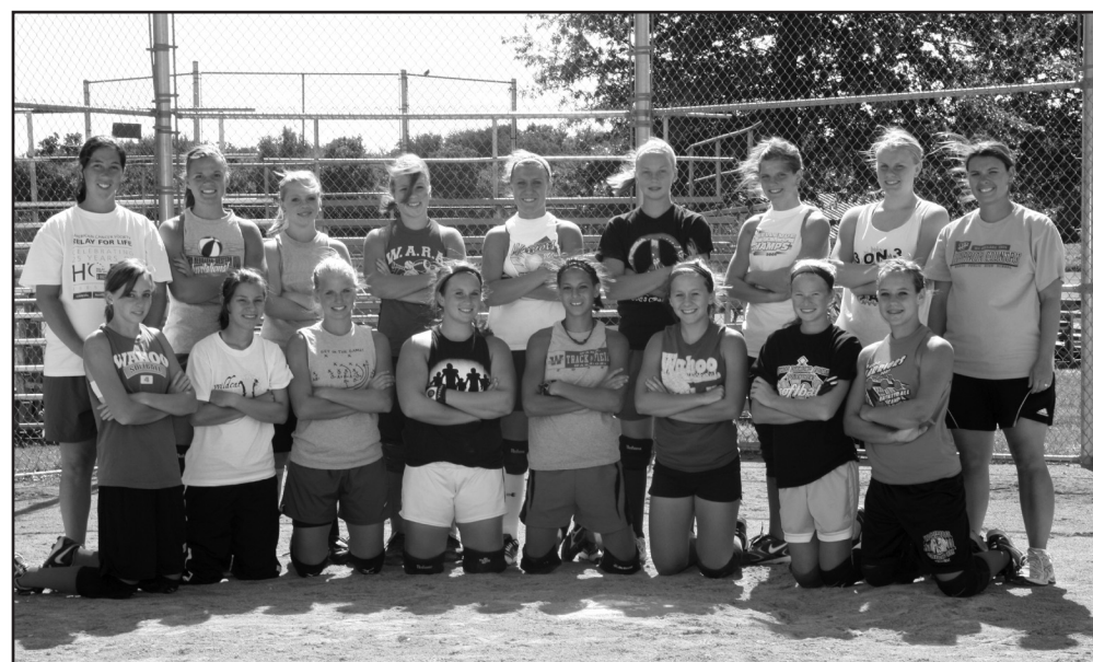
2009 WHS Softball Team

The season has started off swinging and everyone is excited to see just how far our lady Warriors will go! The girls would love to see a lot of people at all of their games, so don't be shy and come cheer on the girls as they battle around the bases!