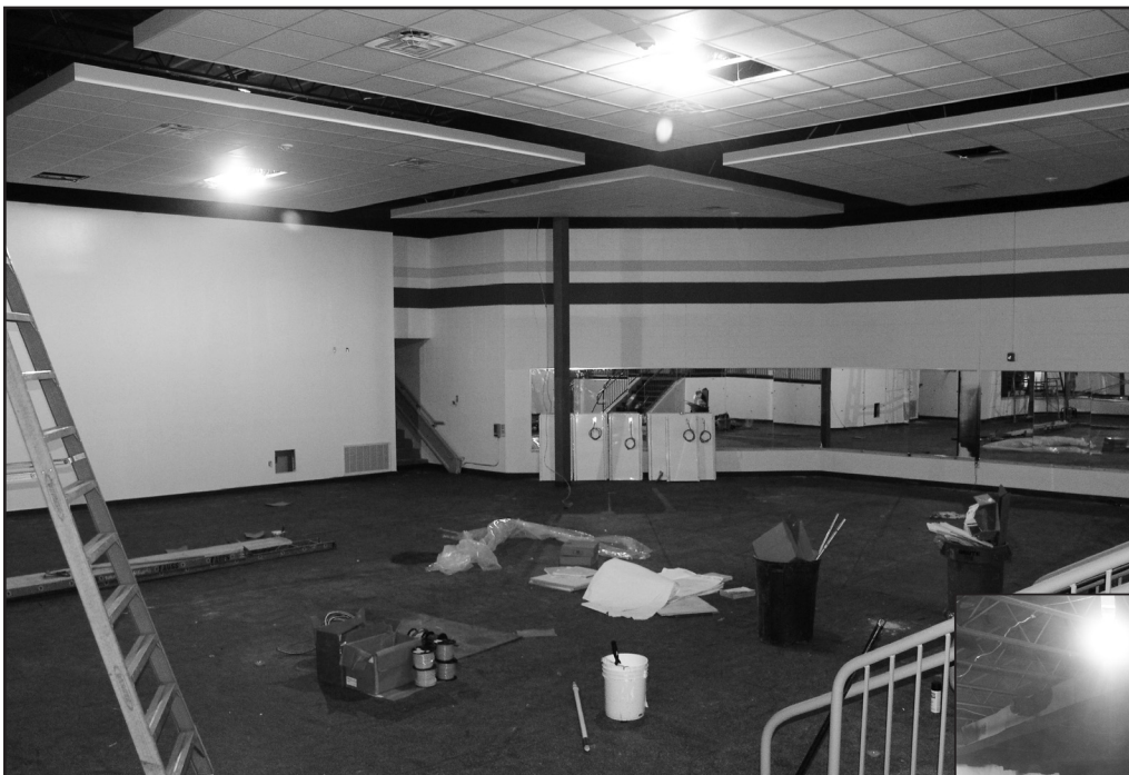
Above: The new weight room has a new floor, ceiling, lighting and a fresh coat of paint. Right: The same area just two weeks ago.