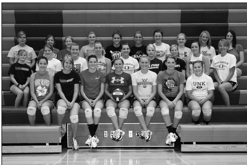
2009 WHS Volleyball Team

The netters are in for an exciting season, and the newspaper staff would like to wish the team good luck with this year, and give it your all!