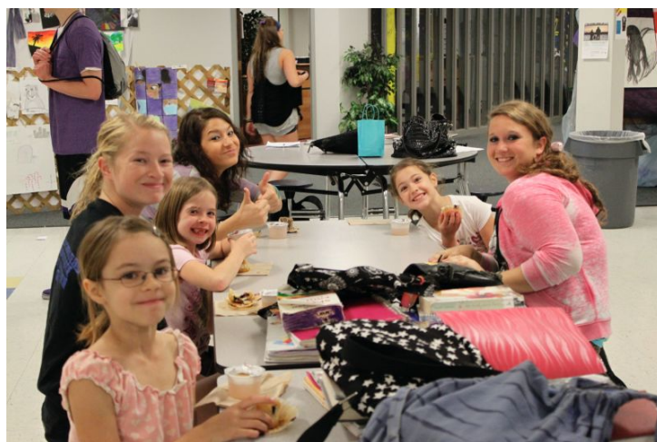
Jr. Mates links High School role models with Elementary & Middle School students