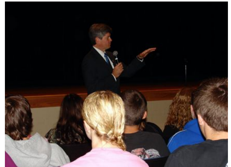
Congressman Fortenberry speaks to Government students about democracy & current events