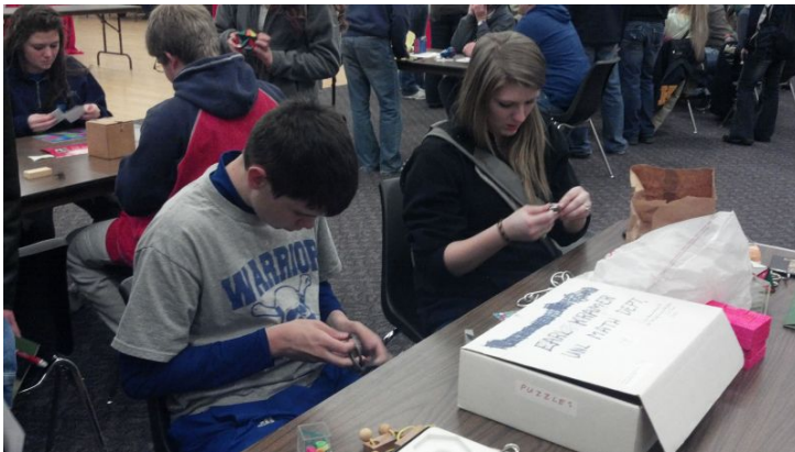
Six high school students competed at UNL's Math Day Academic Competition