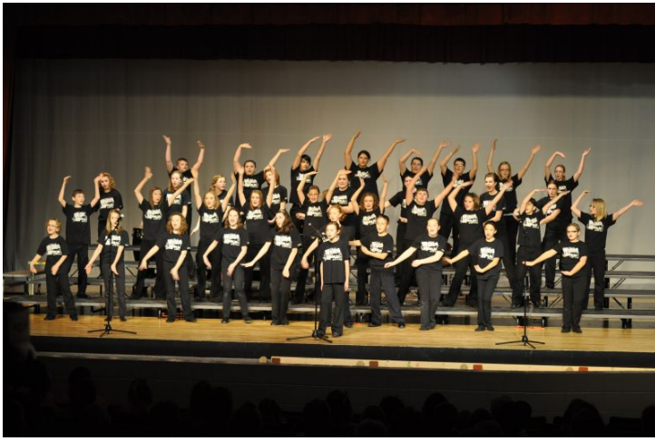
Middle School Show Choir brought home Gold from NCDA Festival in Elkhorn