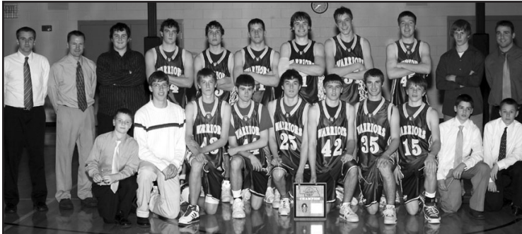
Above: The WHS Boys Basketball Team earn the 2007 District Championship with a season record of 22-1.