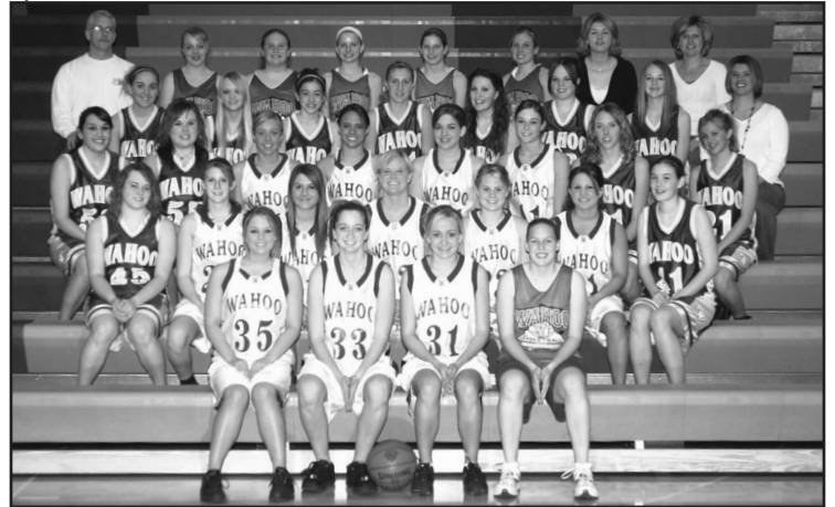
2007 Lady Warriors

The Wahoo Lady Warriors ended there with a season 16-7 record.