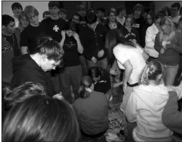
Wahoo High School juniors and seniors sign the "NO ONE IN THIS SCHOOL BELONGS IN A BOX" tarp, committing to a life free from their own scripts and stereotyping others.