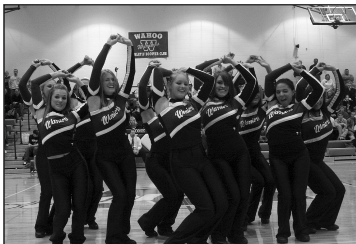
The dance team performs during basketball game half times.

The team also competed at the first annual “Peace, Love and Dance” contest at Arlington High School on Jan. 27. Although they didn’t place