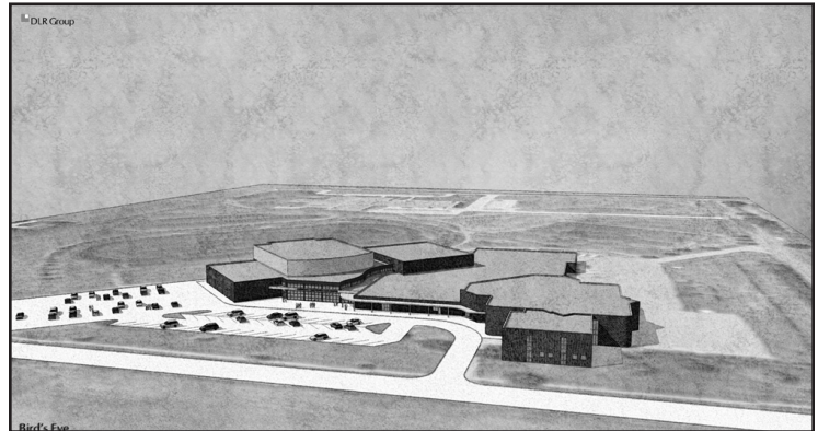
Conceptual sketch of the building with the proposed addition. View from the north-east.

Two new elementary classrooms will also be built completing the elementary master building plan.