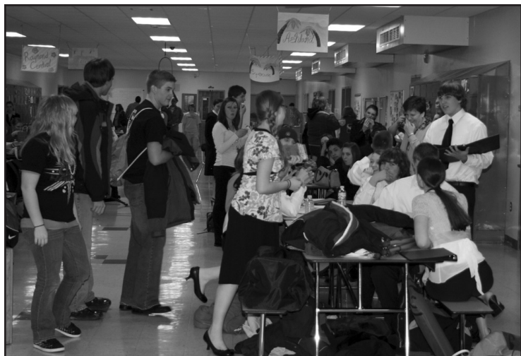
Speech team members from nine different schools met at Wahoo on Feb. 16 for the annual Conference Speech Meet.

On March 4, the Wahoo Speech Team will travel to districts at Omaha Skutt.