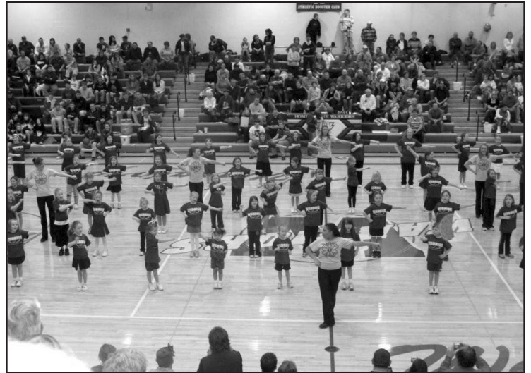
Hannah Montana's song "Life's What You Make It" was a big hit with the elementary dancers.

The cost for the event is $25 and covers the cost of the girls' performance t-shirts.