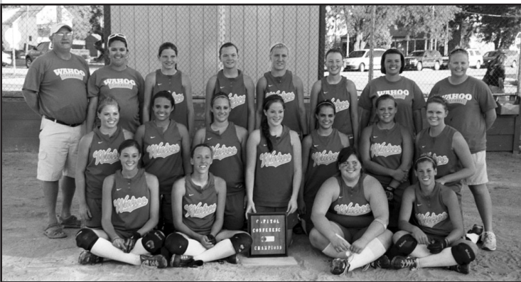
2007 Softball Team