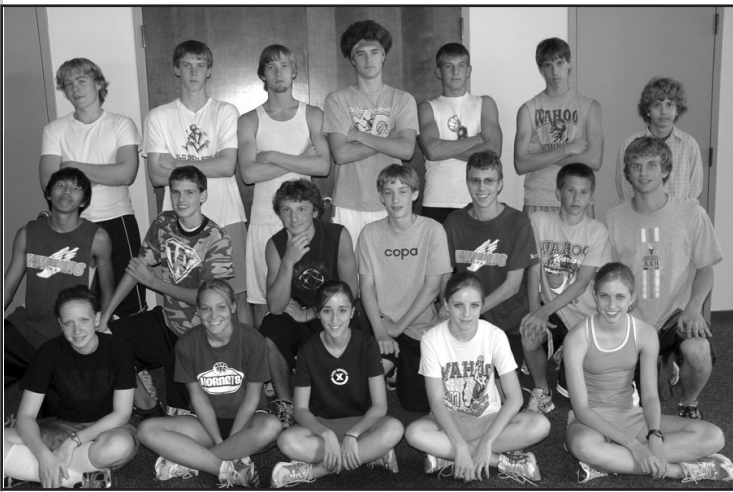
2007 Cross Country Team