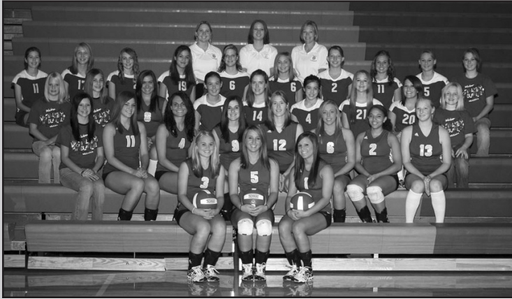
2007 Volleyball Team