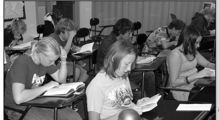
Students in this Warrior Period "Drop Everything and Read."